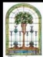
University United Methodist Church