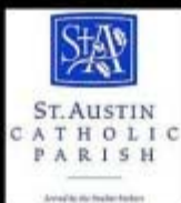
St. Austin Catholic Parish